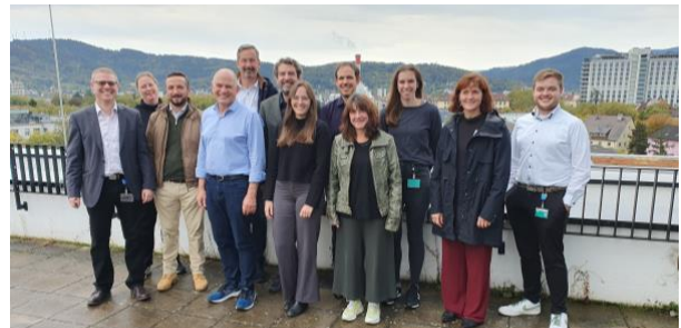
Workshop and Task meeting in Freiburg October 2023.

Save the date: 2 nd Workshop will be on 8-9 October 2024 at DTU, Kgs in Lyngby, Denmark.