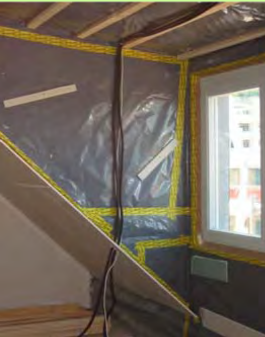
Air tightness in the attic